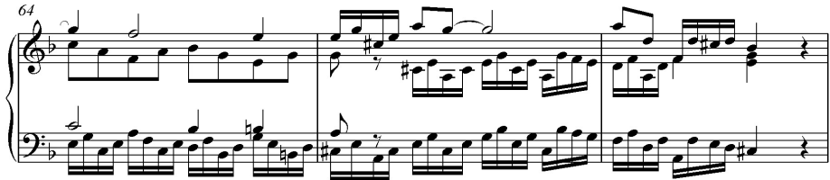
Example 1: Bach, Fugue in D minor BWV 948, bars 64–66

By way of an applied musicology experiment to follow this up discussion of these 'occasional' pedal parts, the 'stick in mouth' method (option four) was tested. This was referred to by Burney as an evident absurdity: Bach "was so fond of full harmony that, besides a constant and active use of the pedals, he is said to have put down